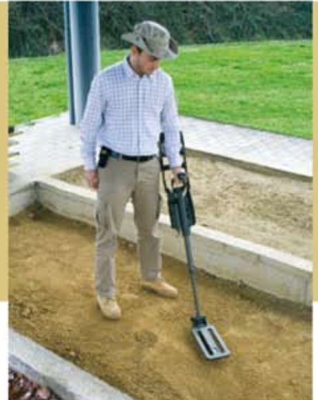
OPERATIONAL TESTS AT THE CEIA TEST SITE

The CEIA CMD is a very high performance, high-sensitivity Compact Metal Detector designed to detect metal and minimum-metal content targets in conductive and non-conductive soils, including laterite and magnetite